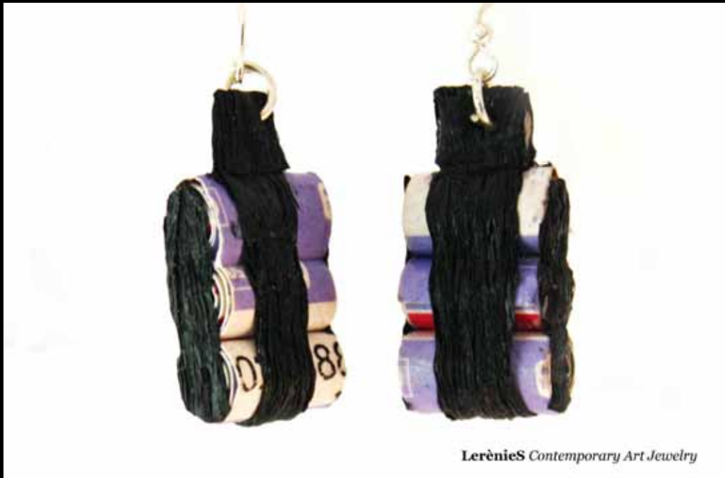
LerènieS Contemporary Art Jewelry