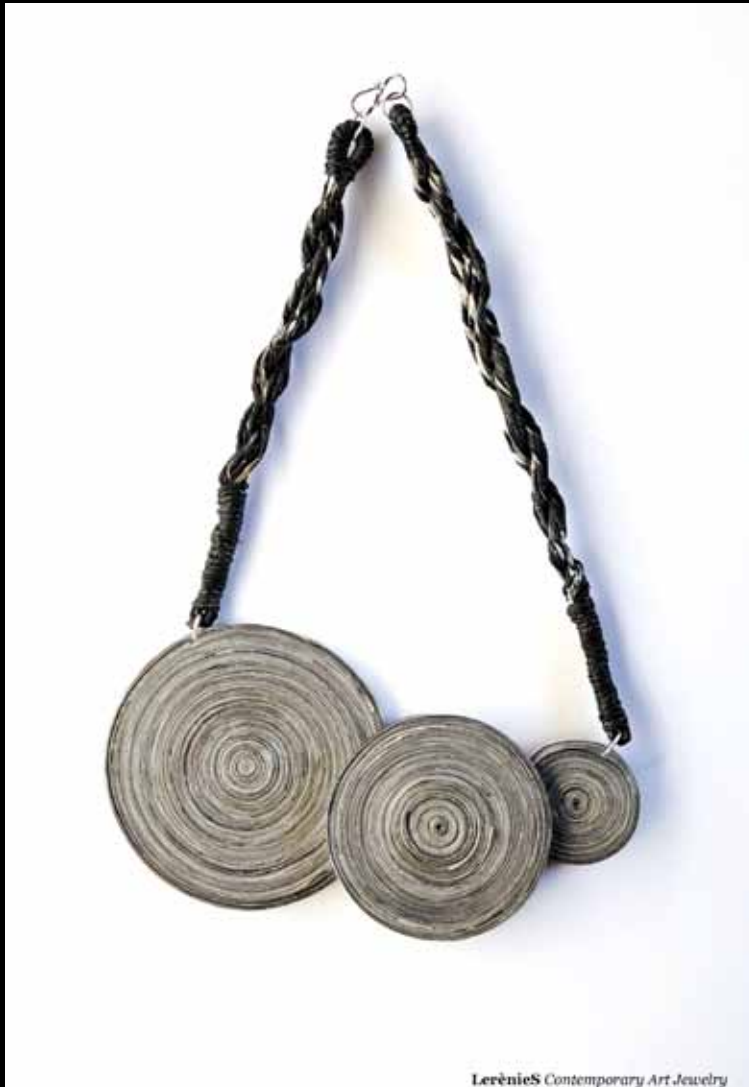
Necklace C013 H.: approx. 25 cm. W.: approx. 16,5 cm.

Materials: scraps of newspaper, crepe paper, vinyl glue diluted with water.