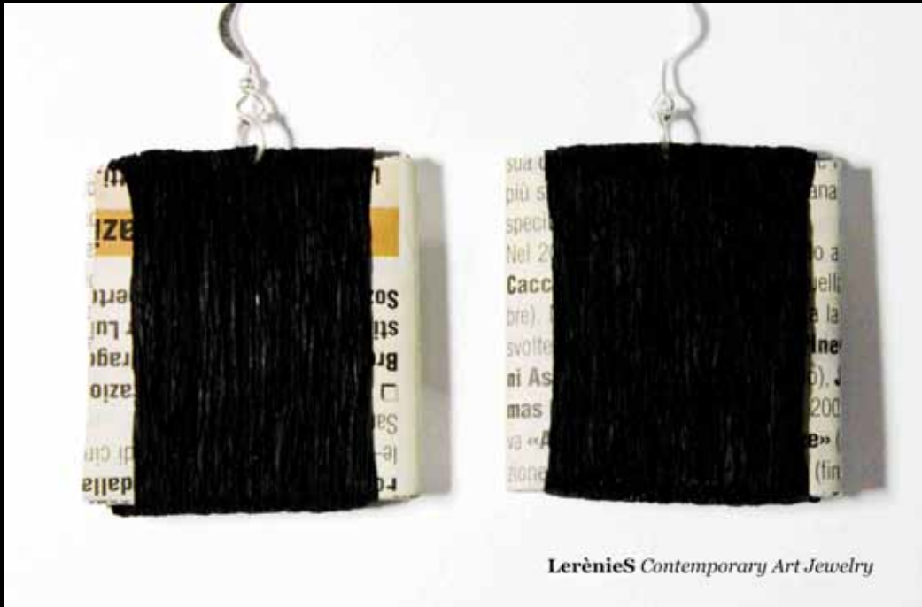
LerènieS Contemporary Art Jewelry