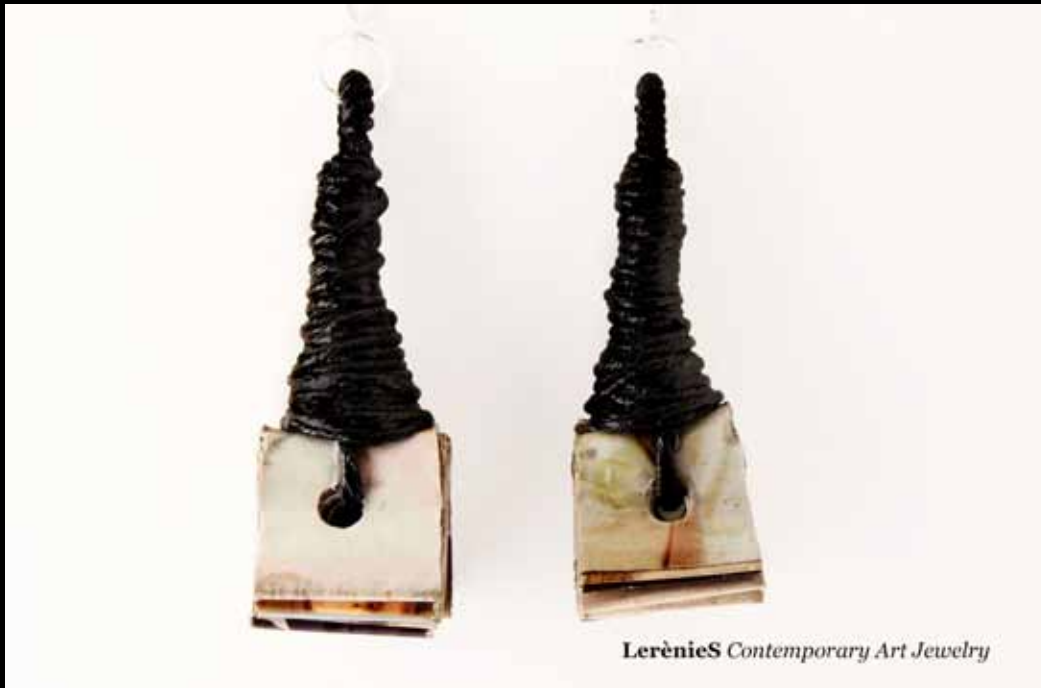
LerènieS Contemporary Art Jewelry