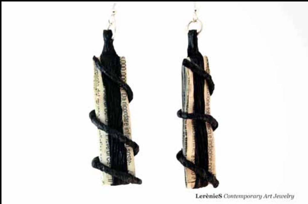
LerènieS Contemporary Art Jewelry