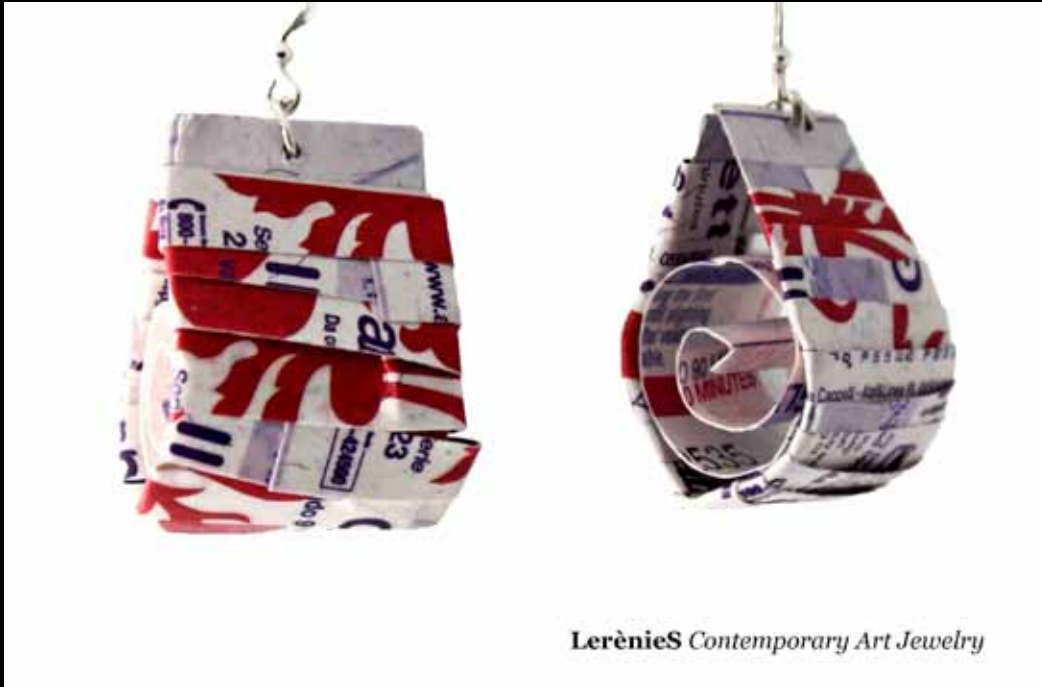
LerènieS Contemporary Art Jewelry