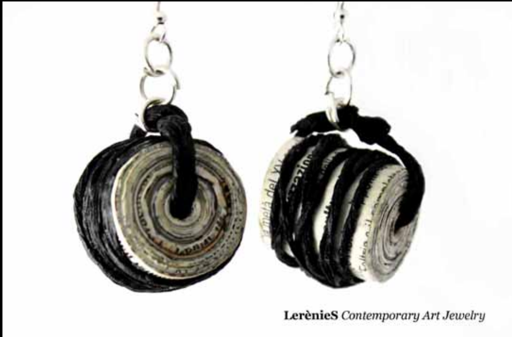
LerènieS Contemporary Art Jewelry