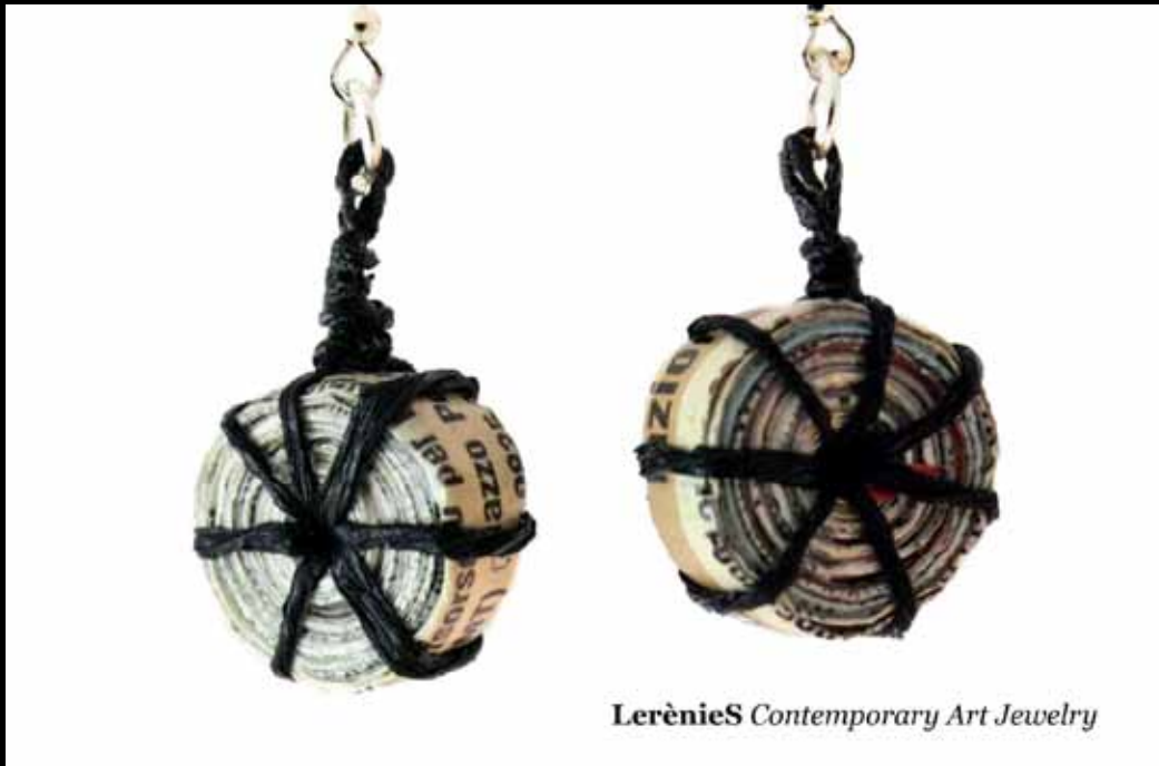
LerènieS Contemporary Art Jewelry