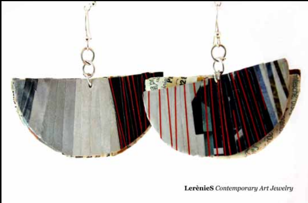
LerènieS Contemporary Art Jewelry